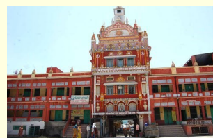
Durga Bhawan Mandir