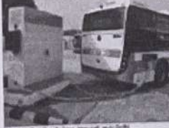
Electric bus in Gurgaon.

Gurgaon: The Gurgaon Municipal Corporation (GMDA) is planning to add 100 electric buses (e-buses) to its fleet by December. The GMDA said that the e-buses will be used for public transport in Gurgaon. The GMDA said that the e-buses will be used for public transport in Gurgaon. The GMDA said that the e-buses will be used for public transport in Gurgaon.