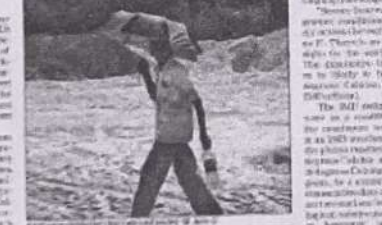
Heatwave in Gurgaon.

Delhi: The India Meteorological Department (IMD) has issued a forecast for a heatwave spell in the region. The IMD said that the heatwave spell is expected to last till June 17, and the night temperatures are likely to cross 30°C. The IMD said that the heatwave spell is expected to last till June 17, and the night temperatures are likely to cross 30°C. The IMD said that the heatwave spell is expected to last till June 17, and the night temperatures are likely to cross 30°C.