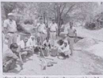
पुलिस को और नौ मालखोर को विचाराधीन अशुभ शराब बनाने के आरोपी और उनके बरामद लाहन और शराब

हरियाणा पुलिस द्वारा अशुभ शराब बनाने वाले गिरोह का भंडाफोड़ कर दोषियों को काबू में लाया गया है। पुलिस ने ड्रोन से रेकी कर 7 आरोपियों को काबू किया गया है। 1600 लीटर लाहन और 50 लीटर कच्ची शराब बरामद की गई है।