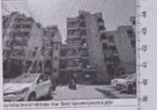
Illegal 4th floor in Gurgaon.

Gurgaon: After several months of work, the City Engineer has decided to seal 58 illegal 4th floors in Gurgaon. The City Engineer said that the 4th floors were built without proper permissions and are a violation of the building code. The City Engineer said that the 4th floors were built without proper permissions and are a violation of the building code. The City Engineer said that the 4th floors were built without proper permissions and are a violation of the building code.