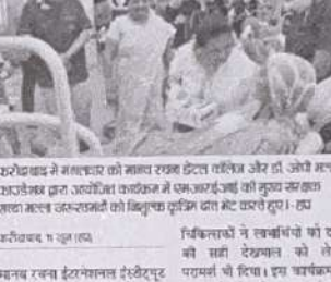
डॉ. औपी भट्टला फ्राउडेशन के द्वारा जरूरतमंदों को बांटे कृत्रिम दांत

मानव रचना डेंटल कॉलेज, डॉ. औपी भट्टला फ्राउडेशन ने जरूरतमंदों को बांटे कृत्रिम दांत।