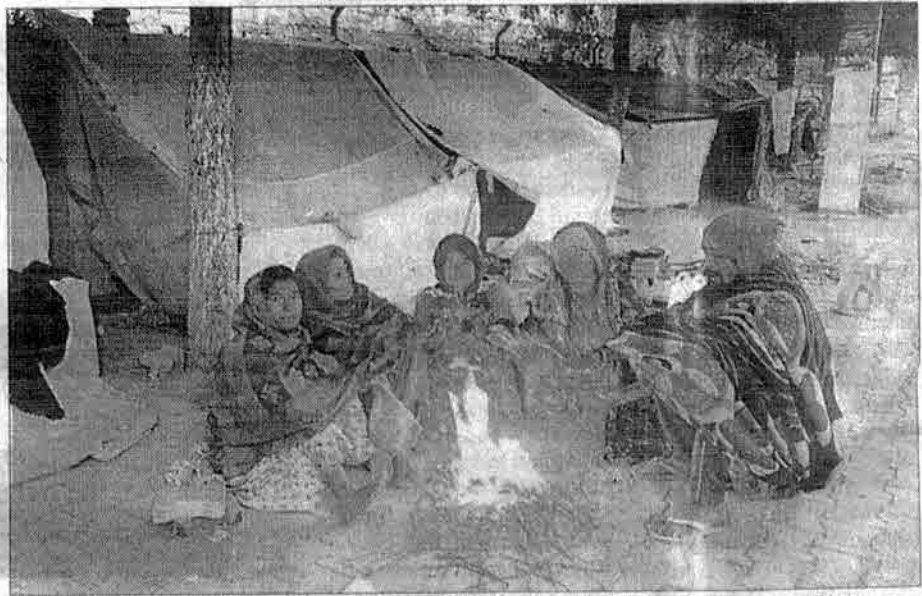
A family of migrant labourers sits by a bonfire on the Rajgarh road in Hisar on Friday.

The worst-sufferers of the cold wave are the homeless migrant labourers who are forced to stay inside their thatched houses along the roadside on the Rajgarh road and in other places in the urban areas. The IMD stated that the weather had been dry