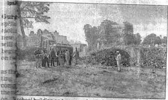
A school building on two acres has to be demolished next

which complex, ICUs, open theatre, tuberculosis ward, Ayush block, ambulance office, and separate orthopaedic, burns and paediatric wards. In 1950 years ago, the old hospital on 5.78 acres of land witnessed nearly six collapses of the ceiling in the last two years. From 2015 and 2017, the Public Health Department submitted reports stating the entire hospital building should be brought down. Last year, the state government approved a revamp by sanctioning Rs 60 crore. In 2015, after the ceiling of the maternity ward collapsed, hospital authorities decided to move the ward to a new government hospital