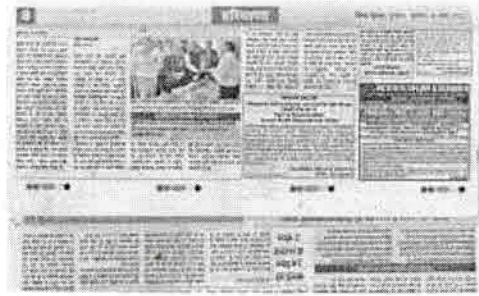
Times Ascent 16 March 2022.jpg