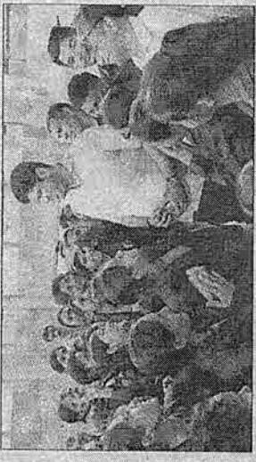
Deputy CM Dushyant Chautala interacts with students of Govt School, Rajthal, Hisar, at the Vidhan Sabha.

He said of the 90 crushers, 61 were found to be adhering to environmental norms, 25 were not complying with the cited norms and emissions and the consent for the operation of four units had