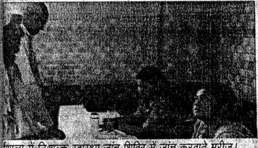
शाला में निशुल्क स्वास्थ्य जांच शिविर में जांच करवाते मरीज।