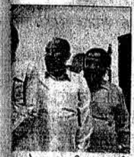
अम्बेडकर की 131 वीं जयंती का कार्यक्रम।

अम्बेडकर की ही सोच 370 का भी संसद में कहा कि बाबा साहेब का कार्यक्रम कादयान ने समाजों के नेता हैं। समितित रखना बड़ी भी को समान अधिकार युवा बाबा साहेब से