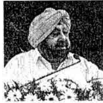
CM Amarinder Singh

"Till date, the Indian Constitution has been amended as many as 127 times, so why can it not be amended once again to scrap the farm laws and resolve the imbroglio resulting from them?" asked the Chief Minister. "What is the problem in doing it a 128th time?" he demanded