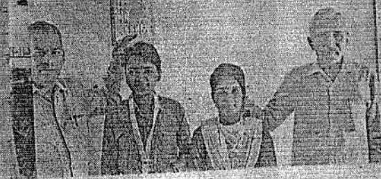
श्री के साथ मेडल विजेता छात्रएं