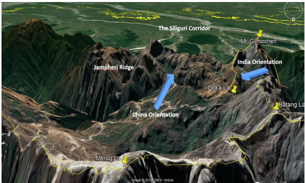
Figure 1. A view from the Doklam Plateau looking South Assam and the Siliguri corridor are easily visible as would be any military mobilisation.

This brings up the question: why Doklam? The answer should be evident in the below image.