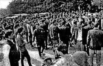
अमरावती के वकीलों ने झूठे मुकदमों में दर्ज करने के खिलाफ अमरावती पुलिस के निष्पक्ष अन्वेषण में सहाय प्रस्तावों का चेहरा धो कर जमानत मिली।

अमरावती (एराएमबी)। जयपुर के वकीलों के खिलाफ झूठे मुकदमों में दर्ज करने पर अमरावती पुलिस के निष्पक्ष अन्वेषण में सहाय प्रस्तावों का चेहरा धो कर जमानत मिली।