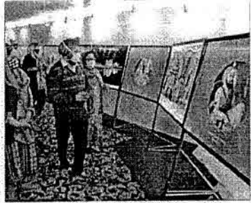
The exhibition at Gurdwara Bangla Sahib in New Delhi. SEE BANS

Malout: Traders of the Malout town on Saturday observed a complete shutdown in protest of an attack on a shopkeeper and his son on Friday here. The police have booked 10 persons. — TNS