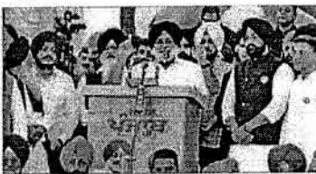
SAD chief Sukhbir Singh Badal addresses a rally in Amloh.