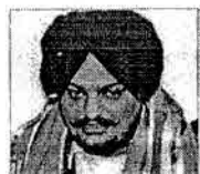
LAUD POLITICAL MOVE

The residents of Mansa have hailed his decision of starting a political career and said the singer must ensure he takes concrete steps so that these projects can be materialised. With the political power he enjoys now, he must put in concerted efforts and try to get the pending developmental