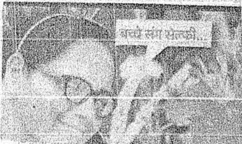
बचपन से पढ़ती...