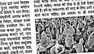
जागरण समारोह में भाग लेते हुए।

हरियाणा की रचना सेवा परिषद द्वारा भव्य विशाल जागरण समारोह का आयोजन किया गया।