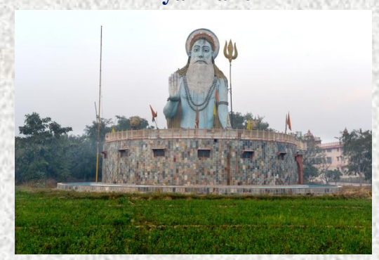
Baba Mastnath Mandir