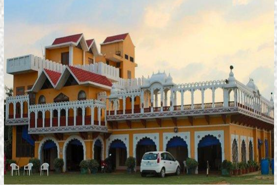
Banni Khera Farm House