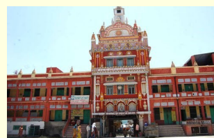
Durga Bhawan Mandir