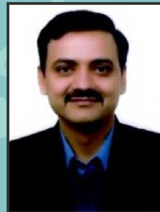
Sh. Satya Narain Gulia (Joint Commissioner, Kendriya Vidyalaya Sangathan, Govt. of India)