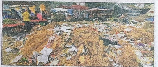
A garbage pile at a market in Gurugram.

After 6 am, Metro trains would run as per the normal timetable. — PTI