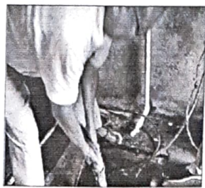
बर्फ फैक्टरी की जमा बरफों को पकड़ना की टीम का दृश्य