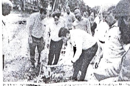
9 LAKH TO BE PLANTED IN DISTRICT DRIVE LAUNCHED

AMBALA —The district administration has announced a drive to plant one lakh saplings in government schools across Ambala district. The drive is aimed at motivating school children to take an interest in environmental protection. The district administration has announced a drive to plant one lakh saplings in government schools across Ambala district. The drive is aimed at motivating school children to take an interest in environmental protection.