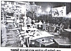
मुख्यमंत्री उड़न दस्ते ने इस प्रान्त पर की कार्रवाई। Here