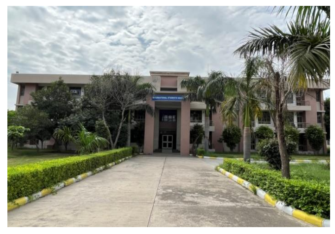
INTERNATIONAL STUDENTS' HOSTEL