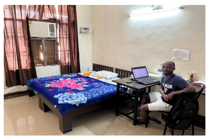
INTERNAL VIEW OF ROOM (INTERNATIONAL STUDENTS' HOSTEL)