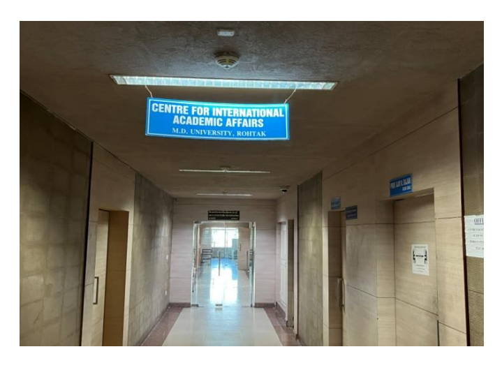
OFFICE OF CENTRE FOR INTERNATIONAL ACADEMIC AFFAIRS