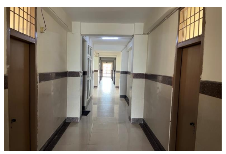
GALLARY OF INTERNATIONAL STUDENTS' HOSTEL