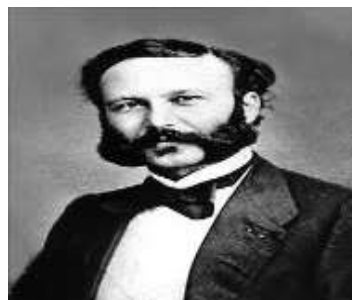
Sir Jean Henry Dunant (8 th May 1828-30 th October, 1910)